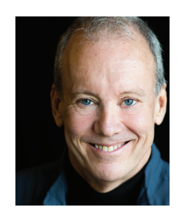
AUGUST 8, 4 P.M. The Upcycle: Designing for Abundance WILLIAM MCDONOUGH '73 Author, The Upcycle Book signing to follow lecture*